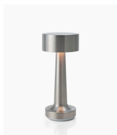
Anodised Silver Aluminium