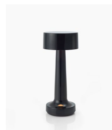
Anodised Satin Black Aluminium