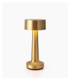
Lacquered Real Brass