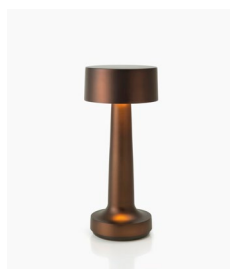
Anodised Satin Bronze Aluminium