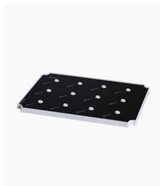
Large Recharging Tray 12 Lamps