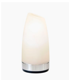
Sand Blasted Hand Blown Glass with Polished Stainless Steel Base