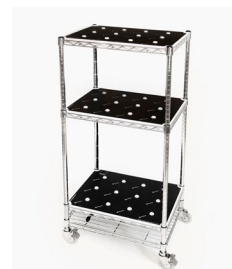
Medium Recharging Station 36 Lamps