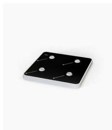
Small Recharging Tray 4 Lamps