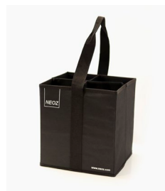
Handling Accessory 4 Lamp Carrier (Optional)