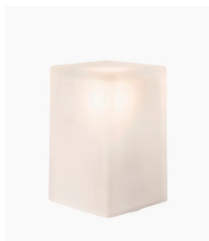
Sand Blasted Pressed Glass