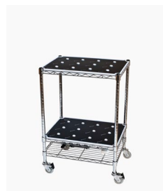
Small Recharging Station 24 Lamps