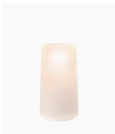
Sand Blasted Pressed Glass