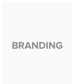
Commercial Customisation Logos