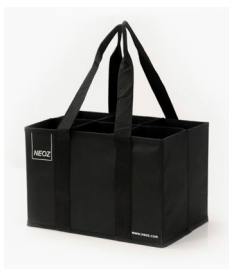
Handling Accessory 6 Lamp Carrier (Optional)