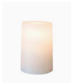
Handmade Resin Opal