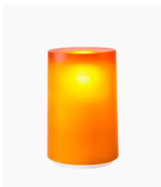
Handmade Resin Amber