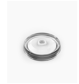
Single Base Station 1 Lamp

Approved for worldwide usage supplied with appropriate mains electric plug type