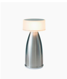
Anodised Stainless Steel