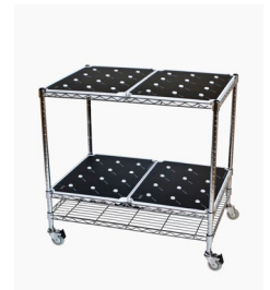
Large Recharging Station 48 Lamps