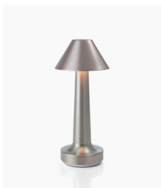
Anodised Silver Aluminium