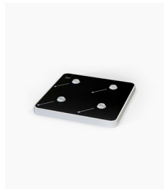
Small Recharging Tray 4 Lamps