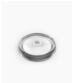
Single Base Station 1 Lamp