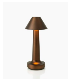
Anodised Satin Bronze Aluminium