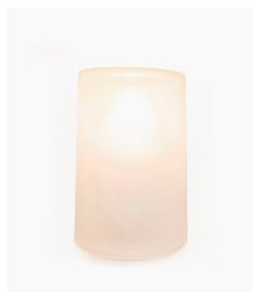
Sand Blasted Pressed Glass