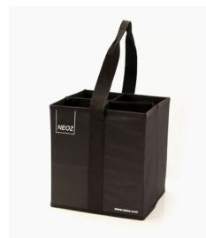
Handling Accessory 4 Lamp Carrier (Optional)