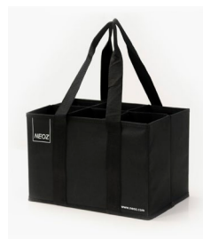
Handling Accessory 6 Lamp Carrier (Optional)