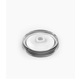
Single Base Station 1 Lamp

100 - 240V Switch-Mode Electronic Power Supply Approved for worldwide usage supplied with appropriate mains electric plug type